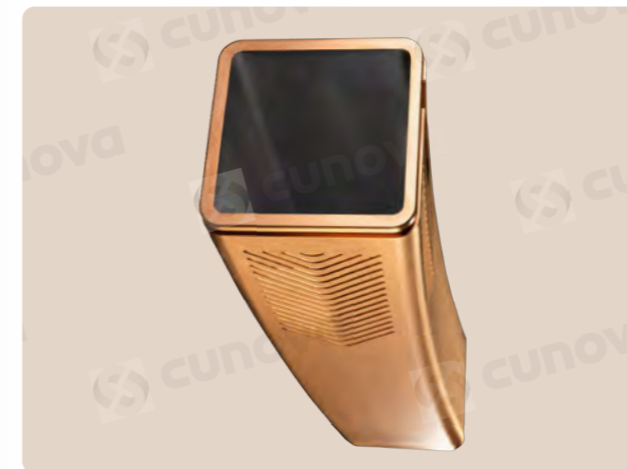
Standard mould tube (flat inside) with CV Cooling Design

Lower hot face temperatures reduce the risk of an attack by harmful elements and early coating damage. Furthermore, the better cooling conditions increase the shell growth, providing a stiffer steel shell as basis for an increase in casting speed.