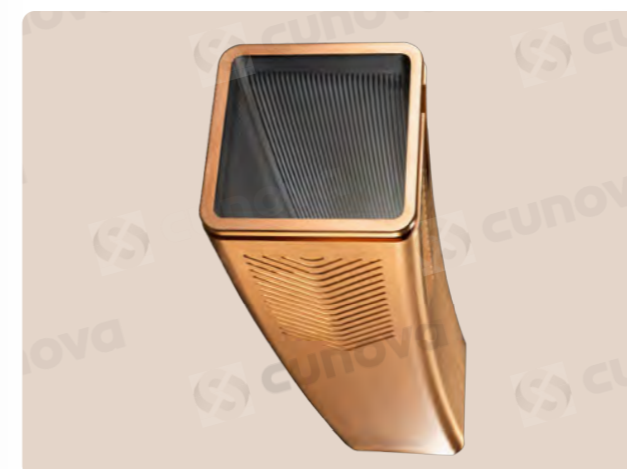
WAVE® mould tube with CV Cooling Design