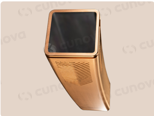
Standard mould tube (flat inside) with CV Cooling Design

Lower hot face temperatures reduce the risk of an attack by harmful elements and early coating damage. Furthermore, the better cooling conditions increase the shell growth, providing a stiffer steel shell as basis for an increase in casting speed.