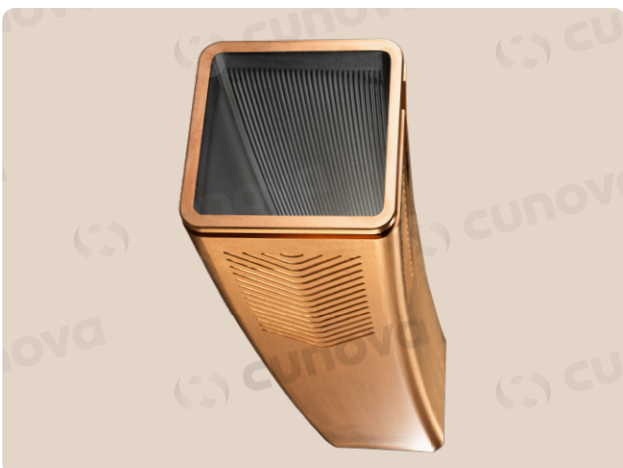
WAVE® mould tube with CV Cooling Design