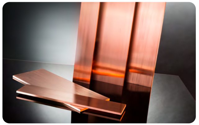
Flat Copper Anodes